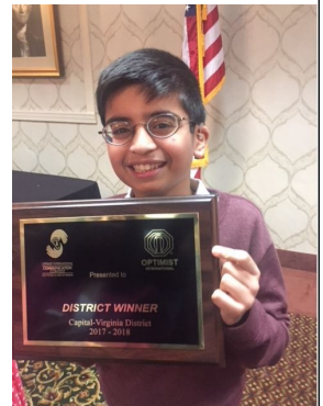
Just one of our proud CCDHH winners who went on to success at the District competition!